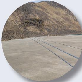
Ground-level storage reservoir