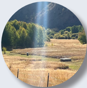
Five infiltration gallery spring sources