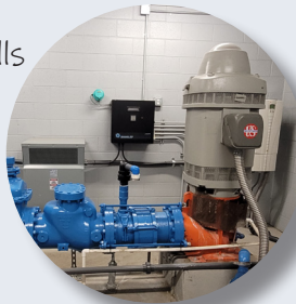
Two groundwater wells

The City of Bellevue owns and operates a public drinking water system (PWS) for residents, several commercial entities, and a school. The PWS is comprised of the following facilities: